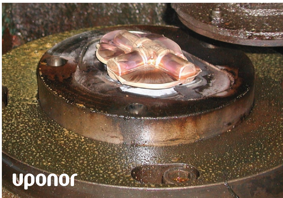
Single Manufacturing of a Brass T-Piece

In addition, Uponor is working on a new layout of the forming process with a new press. This new machine would permit hollow extrusion and thus the preforming of inner contours. The additional savings in material would be substantial. The forming energy would be received by the lower die in this case, diverted