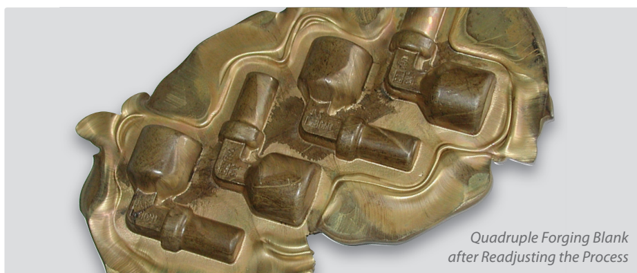
Quadruple Forging Blank after Readjusting the Process