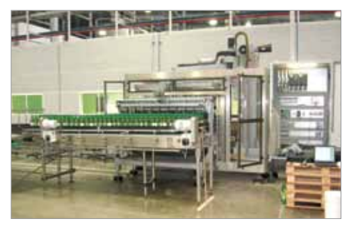
High-speed infeed machine for bottles: physical prototype