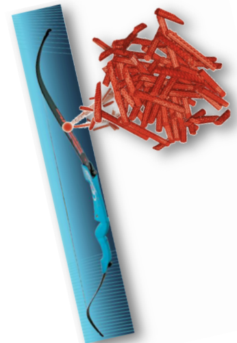
Glass fiber reinforced limbs of a sports bow (50% GF).

"By using DIGIMAT we could clearly demonstrate the tight link between geometry, flow of material, fiber orientation and mechanical behavior. We successfully used the approach to evaluate the endurance of a number of different bow limb designs."